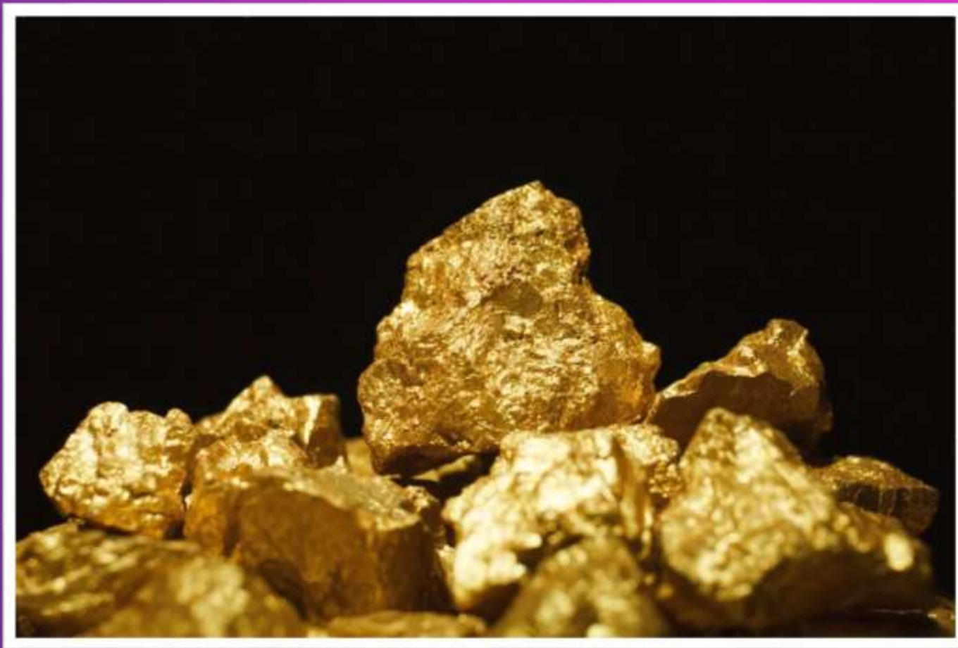
Gold & Minerals Company, U.S & Thailand